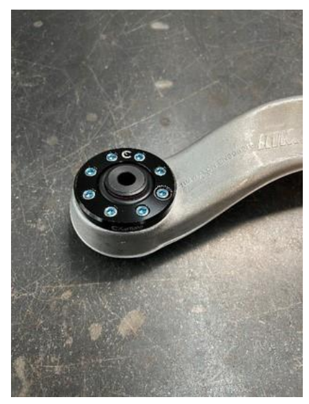
CBG8X-3107/CBG8X-3101 Mono-Ball Kit G8X M3/M4

5. With the mono ball housings fully installed into the arms and you are confident that all the hardware has been torqued to the proper specifications as well as the housings being fully seated you can now refer back to the factory BMW procedures to reinstall the driver and passenger caster arms using the supplied spacers.